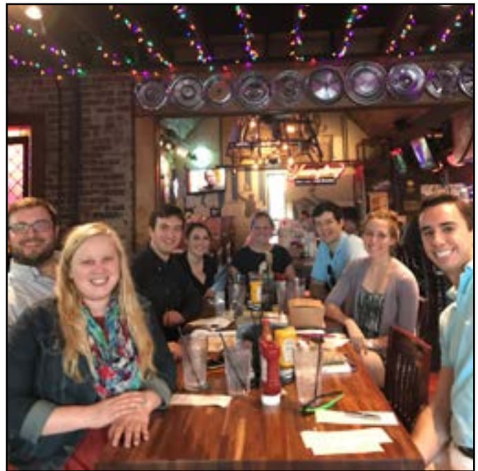
Good fellowship at M.L. Rose during Theology on Tap.